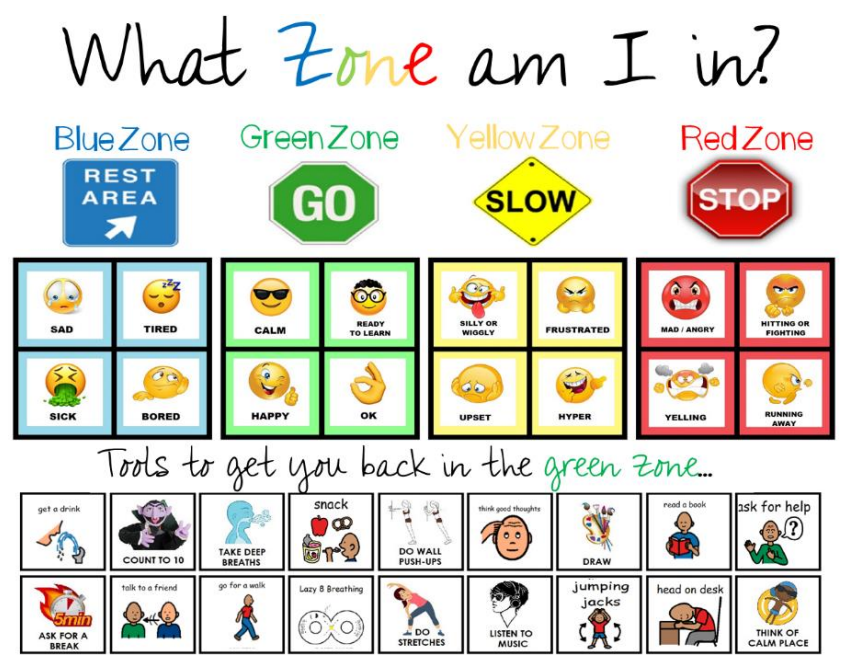
2024 Prep Handbook

All classes at Fernvale State School will use the Zones of Regulation to help children identify their emotions and support children in being able to recognise strategies that can support them in each zone. In addition, all staff have been trained and model the language of the zones every day across our school. You will see the posters below in our teaching and learning areas across our school. All children will participate in the explicit teaching of each Zone and tools/strategies to support them.